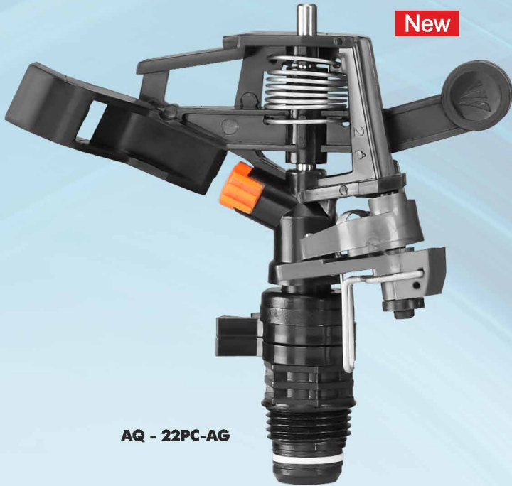
AQ - 22PC-AG